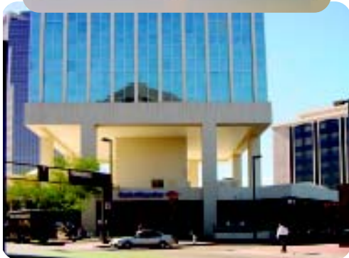
AAED's new Tucson location