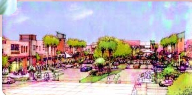
Yuma Palms Regional Center, a Westcor Development Partners project, is scheduled to open on November 11, 2004

Another company announcing a new location in Tucson is Infotech Strategies which is based in Washington D.C. The company specializes in IT and communication consulting and is locating within the city's Rio Nuevo downtown redevelopment area.