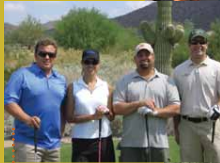
GET A GRIP AND HAVE FUN AT NEXT YEAR'S AAED GOLF TOURNEY.