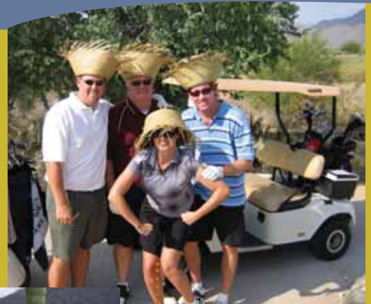
EVEN THOUGH THIS FOURSOME IS WEARING BEACHCOMBER HATS, THEY WERE LUCKY ENOUGH TO STAY OUT OF THE SAND.

We are proud to announce that this year's 11th Annual fund raising Golf Classic was a complete success. With palm trees and leis, margaritas and tequila shots, bobcats wandering the greens, and of course the Butthead Covers sponsored by Cox Communications, there was never a dull moment. We would like to thank all of the tournament sponsors as well as each and every person who came out to the Sanctuary at Westworld to support AAED. This year, we were able to raise more than $14,700! We hope to see you all again at next year's golf tournament.