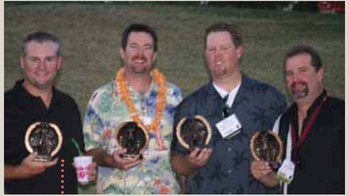
THE USUAL GOLF SUSPECTS! AGAIN?