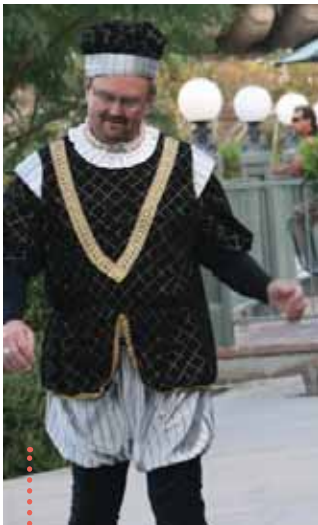
INTRODUCING LORD DAVID NEWLIN