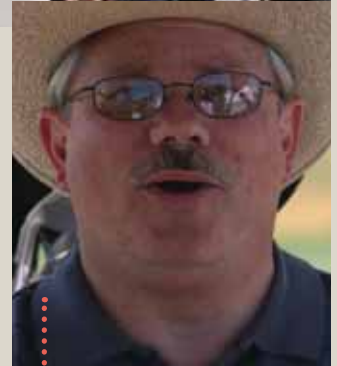
ANOTHER FAIRMAN BOGEY!