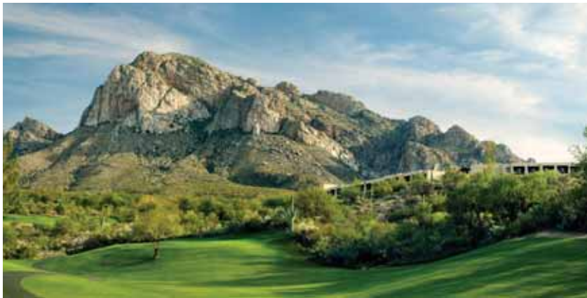
HILTON EL CONQUISTADOR RESORT IN ORO VALLEY

Be sure to mark your calendars and register online now for this year's Governor's Rural Development Conference on August 15 – 17. It's being held in the cool climate at the base of the highly elevated Catalina Mountains (sounds cooler already) in Oro Valley at the Hilton El Conquistador Resort.