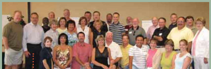
RETREAT PARTICIPANTS – 36 AAED leaders spent a Friday and Saturday last month at the retreat in Sedona.