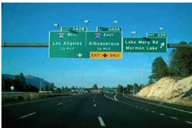
I-17/I-40 JUNCTION IN FLAGSTAFF

ADOT advises drivers on I-17 to slow down and be aware of changes in temporary lane markers and traffic flow.