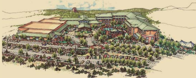
THE RESORT AT THE RANCH PRESCOTT, AZ SEPTEMBER 01, 2007

The City of Prescott has approved an agreement with Ponderosa Hotel Management Services for the development of Resort at the Ranch, a four-star quality hotel and conference center. As a part of the deal, the