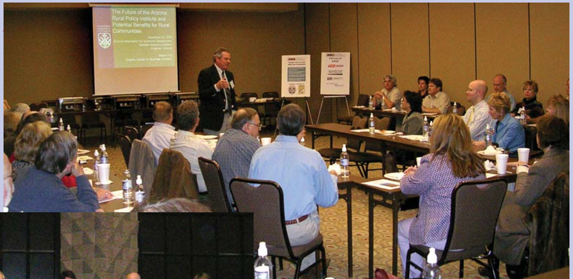
THE NOVEMBER '06 NORTHERN ARIZONA LUNCHEON IN KINGMAN SHOWING THE PROGRAM IN PROGRESS

The very best wishes for a happy and prosperous New Year.